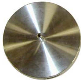
Base Cap (#141-01)