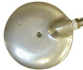
Top Cap (#141-02)