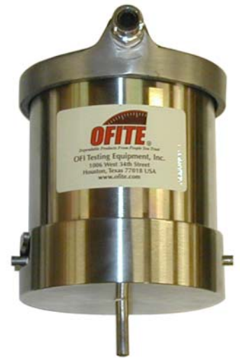
Assembled Test Cell